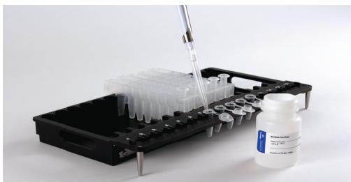
Figure 2. Setup and configuration of the deck tray(s). Nuclease-Free Water is added to the elution tubes as shown. Plungers are in well #8 of the cartridge.